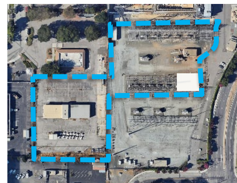
Kifer Receiving Station