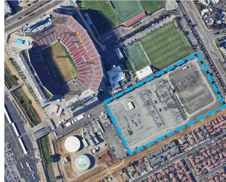
Northern Receiving Station