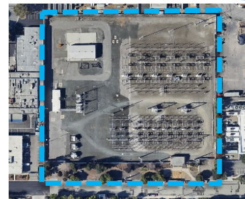
Scott Receiving Station