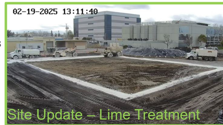
Site Update – Lime Treatment