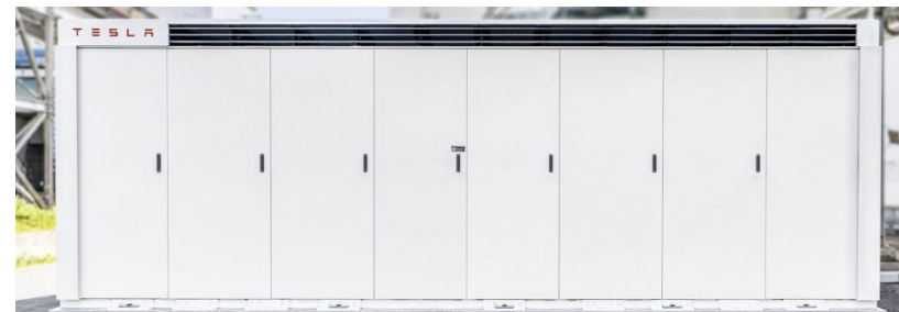
Example of a Tesla Megapack