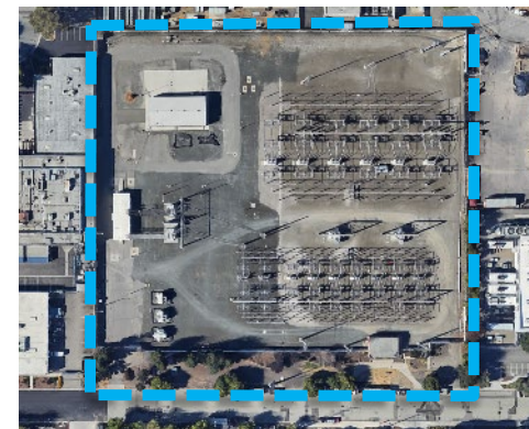
Scott Receiving Station